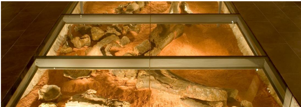
Sauropod remains at the Museo Paleontológico de Alpuente.