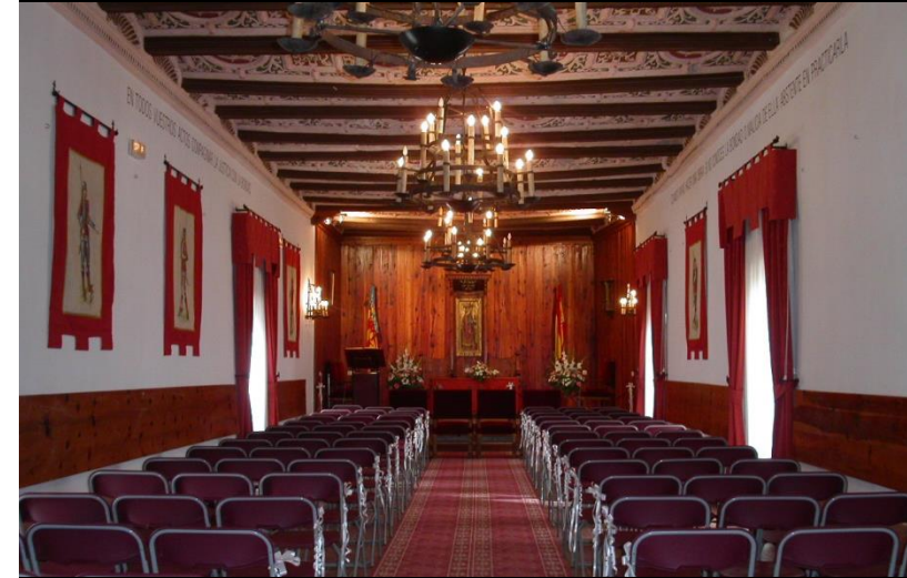
Conference hall in Torre de la Aljama (Alpuente).