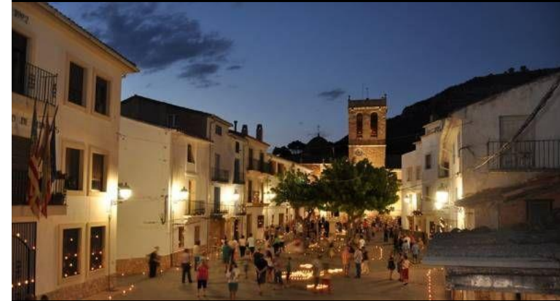
View of Titaguás, the location of the meeting accommodation.