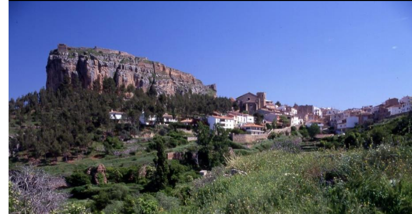
Present-day panoramic view of Alpuente.